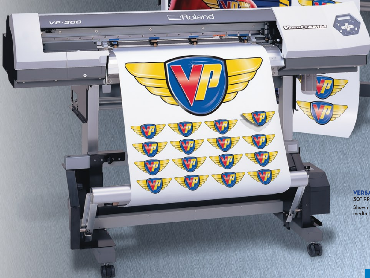
VERSACAMM VP-300 30" PRINTER/CUTTER Shown with optional heavy-duty media take-up system.