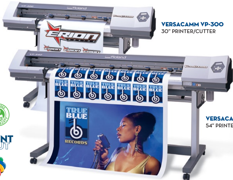
VERSACAMM VP-300 30" PRINTER/CUTTER