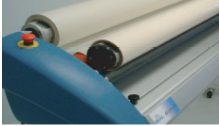
Release Liner Take-up (62 Ultra S & C)