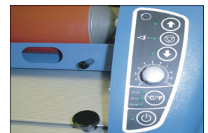
Simple Control Panel