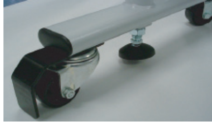
Anti-tip Bar (62 Ultra S & C)