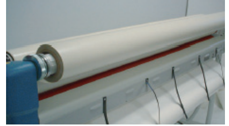
Back out-feed table (62 Ultra C only)