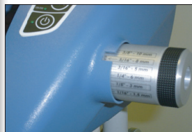
Flexible Nip Adjustment