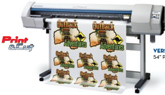
VERSACAMM SP-540V 54" PRINTER/CUTTER