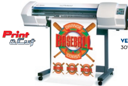
VERSACAMM SP-300V 30" PRINTER/CUTTER